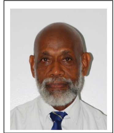
Commissioner Waeta Ben Tabusasi