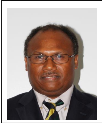
Commissioner Gabriel Suri