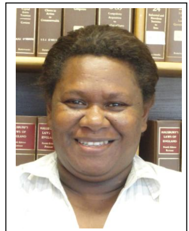
Commissioner Emmanuella Kauhue