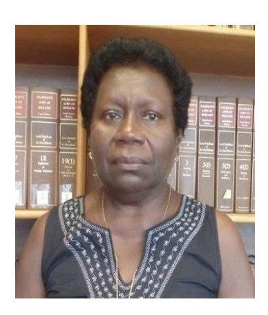
Commissioner Ruth Liloqula